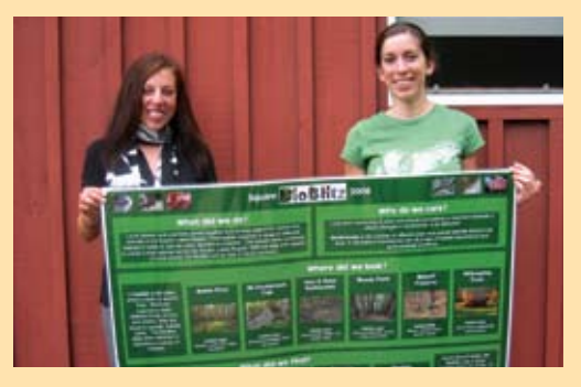
REU students created a poster to share their findings.

and universities around the country will be selected to participate in this 10-week program. Funding comes from the National Science Foundation's REU program and the Hubbard Brook Consortium.